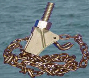
(D3) CHAIN CLAMPS

FOR LARGER DIAMETER HOSES, 6' CHAIN CLAMP WITH ADJUSTING HEX NUT.