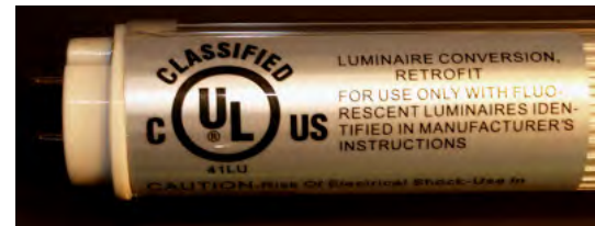
UL Classified US & Canada