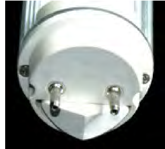
Patented Safety Switch